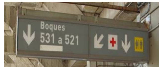
Directional Signage- Clear Pictogrammes.