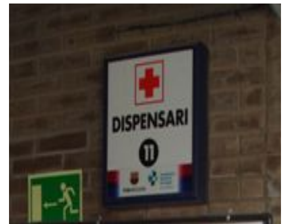
First Aid facility ( Medical Room #11) exclusively for supporters in visitor sector