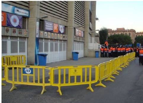
1) Supporters accompanied to gates (46, 50, 51 and 52)

In case of large numbers of visiting team supporters travelling to Camp Nou for a UEFA Champions League match, the Catalan Police and Club Security Department may decide to open Access 21 as an exclusive entrance for Visiting team supporters from 18:00 to 19:00 in order to speed up the ingress procedure. This will be discussed during the preparation phase.