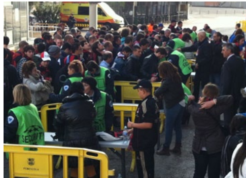
2) Body search at gates 46, 50, 51 and 52 with second ticket check with barcode at turnstile to enter into the Stadium