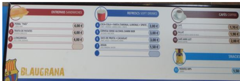
Food & beverage stands.