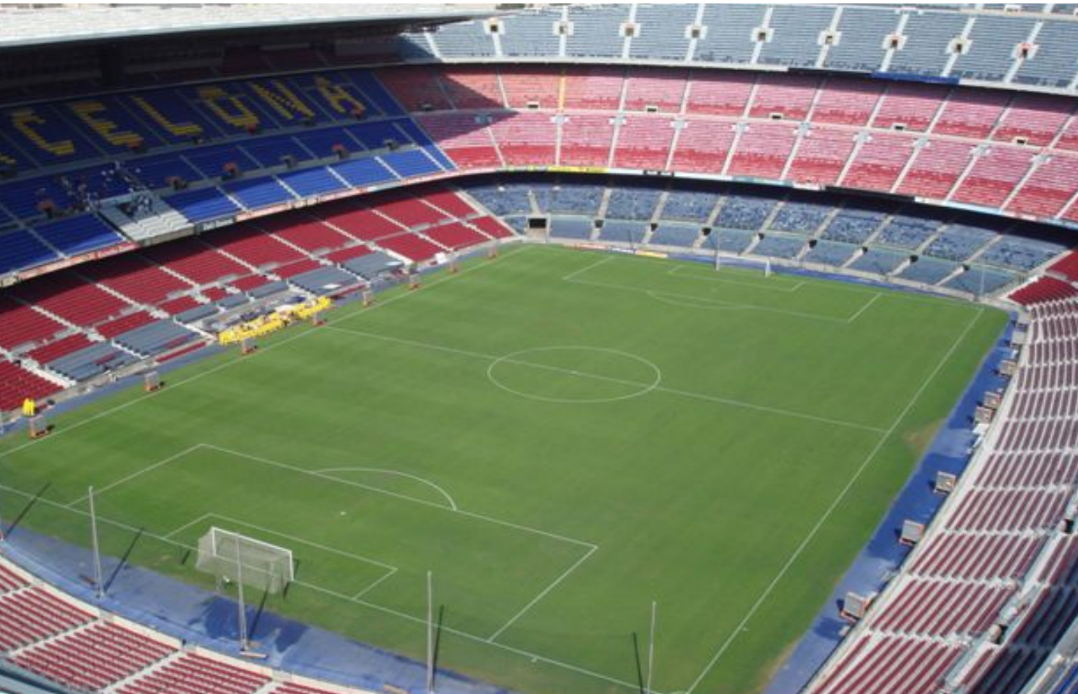
View from the visiting supporters sector