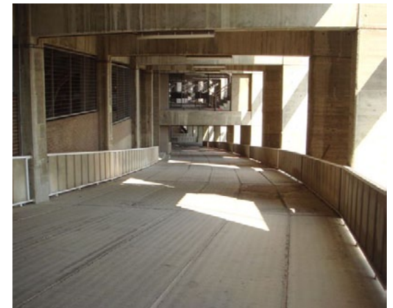
Exit ramp for visiting team supporters after match.